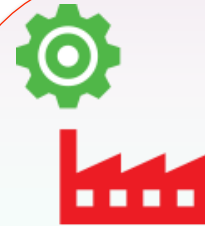
Formulated Specialty Products