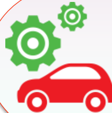
Automotive & Industrial Lubricants