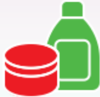
White & Mineral Oil